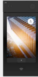
2N IP Style (supports secured cards) 9157101-S