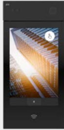
2N IP Style 9157101