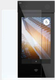
2N IP Style AntiBac 9157101P