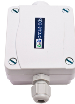
SK10-TC without Temperature Sensor