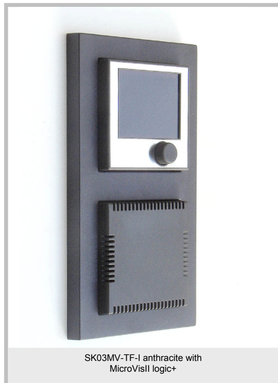
SK03MV-TF-I anthracite with MicroVisII logic+

As a service can you purchase from Arcus-EDS Forth-programs, controllers or other elements customized for your application.