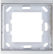
Fig. 2 Place the assembly bracket of the cover on the Corlo Plan frame. The bracket has to snap in.