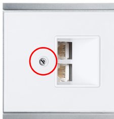
Fig. 4 Put the glass cover in place and screw it on (pan head screw).