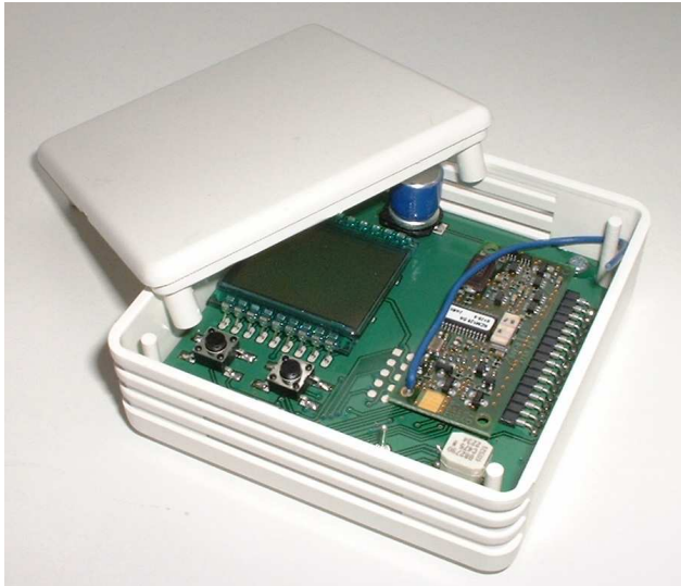
Figure 1: Gateway

KNX ENO 610 acts as a gateway between EnOcean radio sensors and the EIB/KNX bus. It has 32 channels, each of which can be configured with one of the following functions: